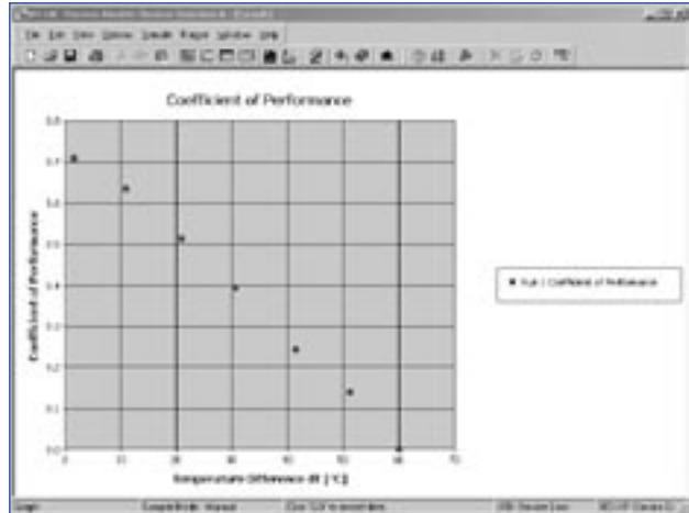
Typical software screen shot